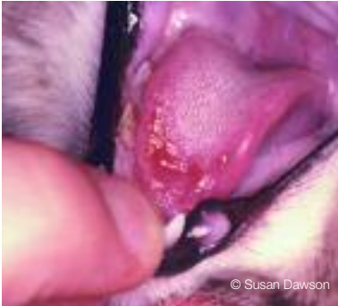
1. Large ulcer on the tongue of a cat infected with feline calicivirus.