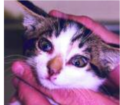
3. Sore eyes (conjunctivitis) and crusting around the nose in a kitten infected with feline calicivirus.