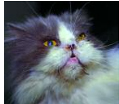
6. This cat has a Bordetella bronchiseptica infection and is showing many of the signs typically associated with cat 'flu. In any outbreak of respiratory disease, it is often difficult to differentiate which of the infectious causes is responsible, without further testing.