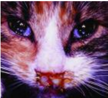
4. This cat is showing signs of severe cat 'flu with marked nasal discharge. Intensive care including intravenous fluids was needed for treatment.