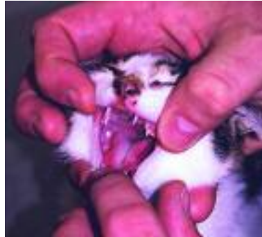
2. Oral ulcers may sometimes be harder to detect but they may still make feeding painful and difficult in affected animals.