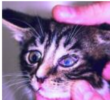
5. The clear part of the eye (cornea) has also become infected in this kitten with herpesvirus infection to cause keratoconjunctivitis. This can lead to ulcers on the eye surface which may prove very painful and result in loss of vision. Such a problem may be difficult to treat successfully and recurrences throughout life may be seen in some individual cats.